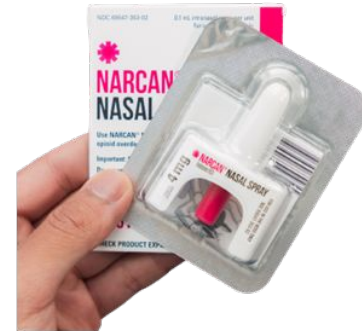
Narcan Naloxone Nasal Spray