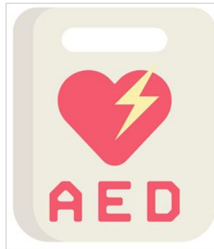
Automated External Defibrillator (AED)